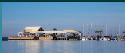
Panama City Marina