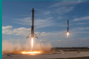
Falcon Heave Demo | Kennedy Space Center, FL