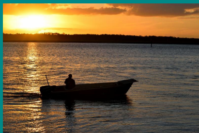
Vilano Beach, Florida