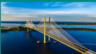
Dames Point Bridge in Jacksonville; CC0 Public Domain