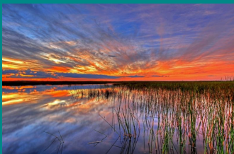
Everglades Sunset; CC0 Public Domain