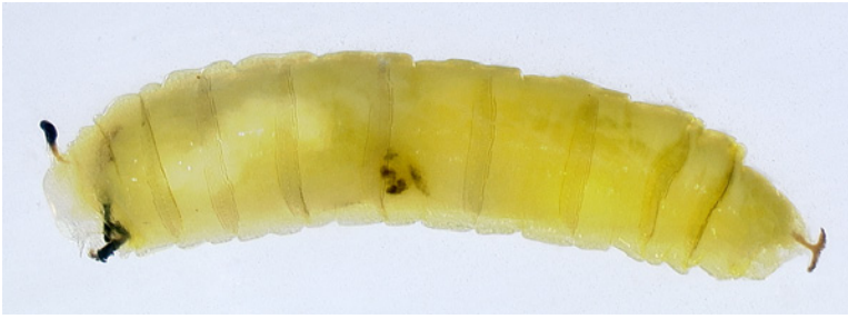
Fig. 4. Larva of Ophiomyia kwansonis .