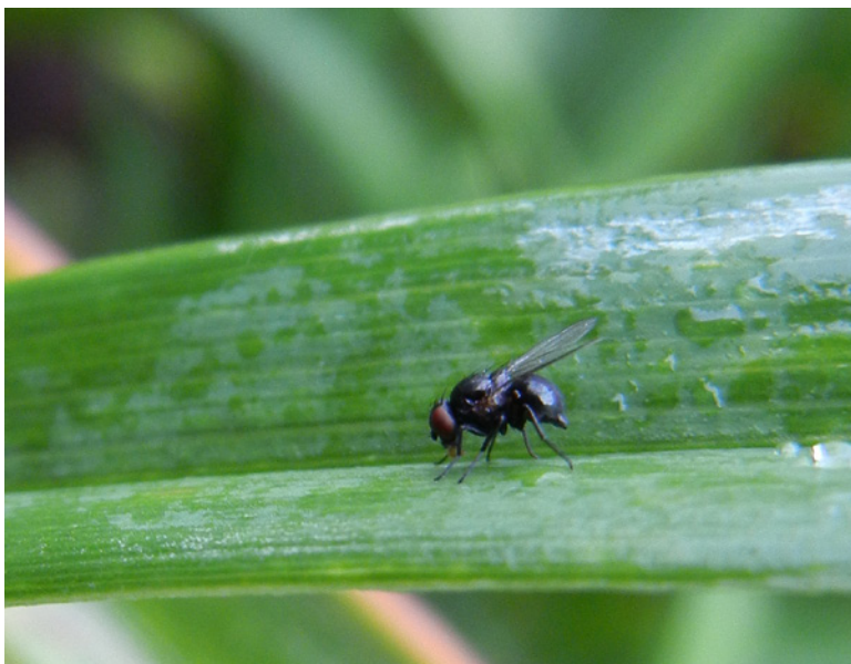
Fig. 7. Female Ophiomyia kwansonis on daylily leaf.