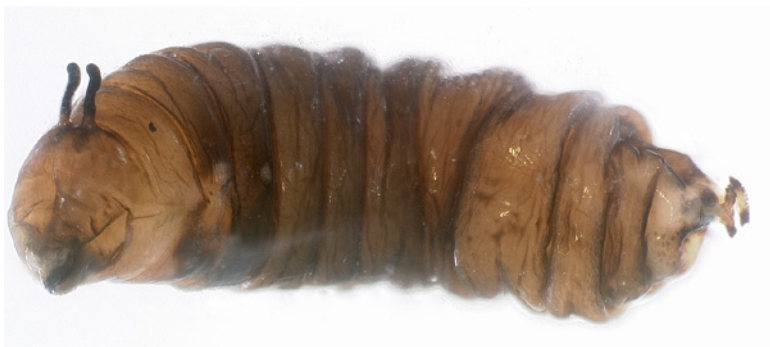
Fig. 1. Prepupa of Ophiomyia kwansonis .