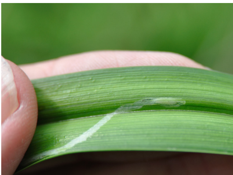
Fig. 3. Ophiomyia kwansonis larva in daylily leaf mine.