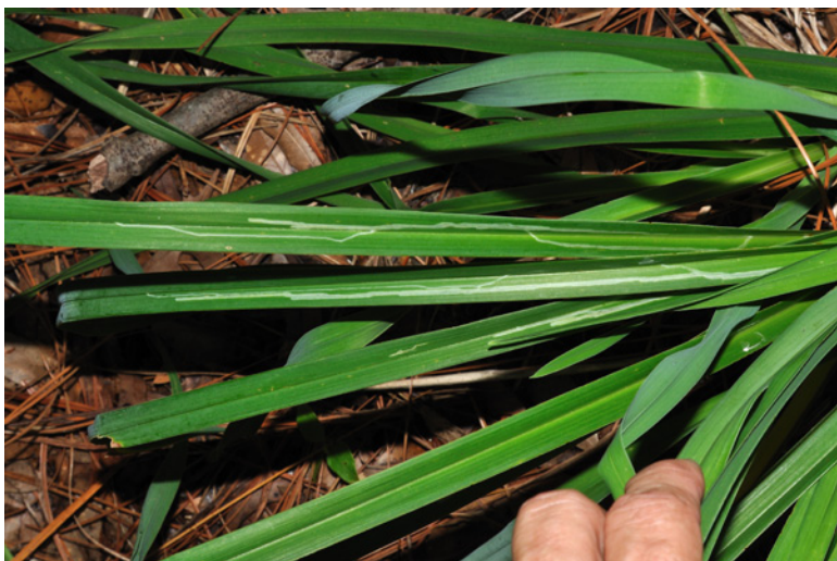
Fig. 2. Ophiomyia kwansonis leaf mines in daylily.