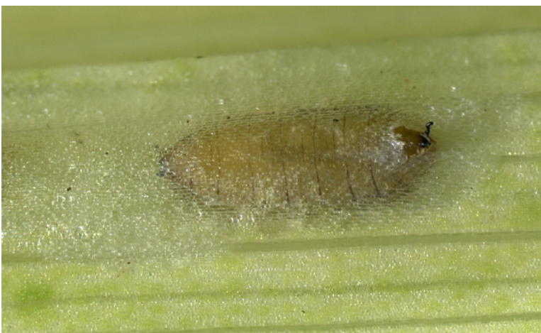
Fig. 6. Ophiomyia kwansonis pupa in daylily leaf mine.