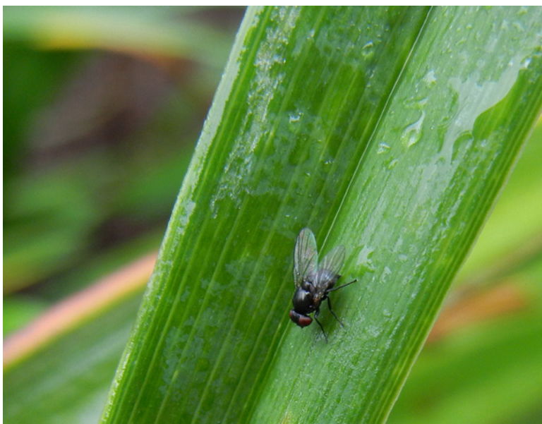
Fig. 8. Female Ophiomyia kwansonis ovipositing into daylily leaf.