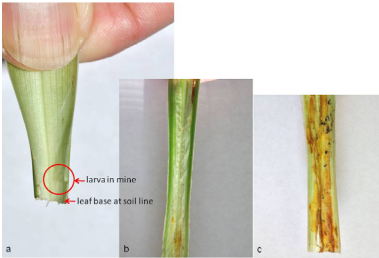
Fig. 9. Progression of Ophiomyia kwansonis leaf mine symptoms.